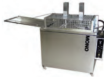
Table Top Fryer