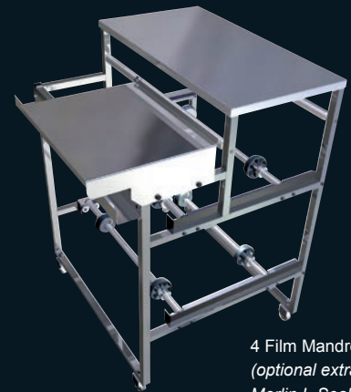
4 Film Mandrel (optional extra for Merlin L-Sealer)