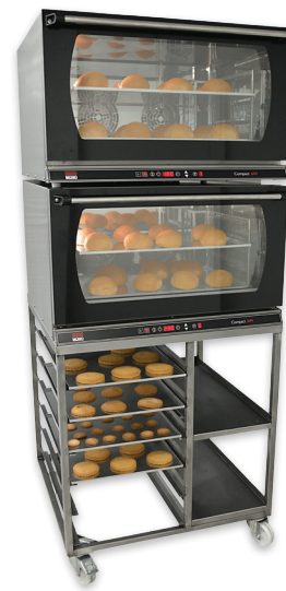
Optional Extras and Configurations Racked Base Unit for Compact 643 and Compact 644

Please contact MONO Equipment for USA electrical details.