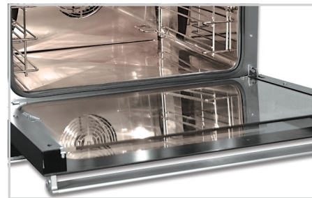
Twin pane vented glass reduces external door temperature