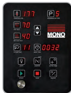
The Classic Controller