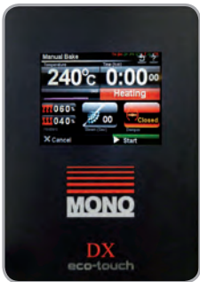
The Eco-Touch Controller